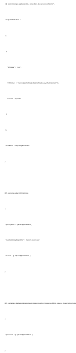
Example 14 EPS Bearer Services Policy